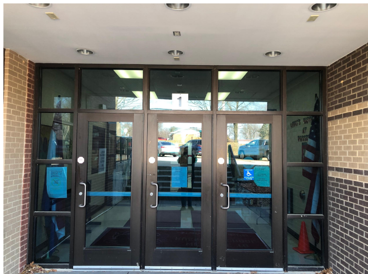
Bus riders (#1)