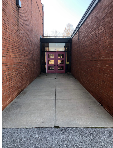
Car riders/daycare (#4)