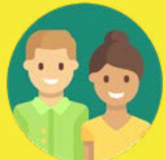
Parent Kickoff Video

THIS YEAR YOU CAN PARTICIPATE COMPLETELY ONLINE!