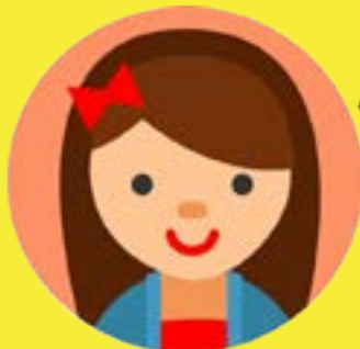
Student Kickoff Video